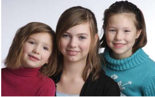
My three daughters are a joy and the reason that I serve.