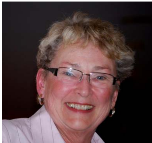
My Mom is an inspiration to me and she has been such a great role model for my girls. She is a dentist who has spent her career serving low income patients.